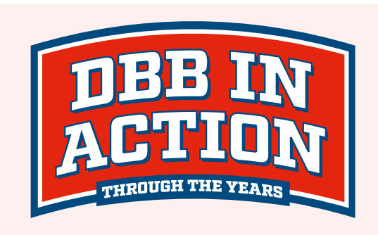
Memorable DBB Moments